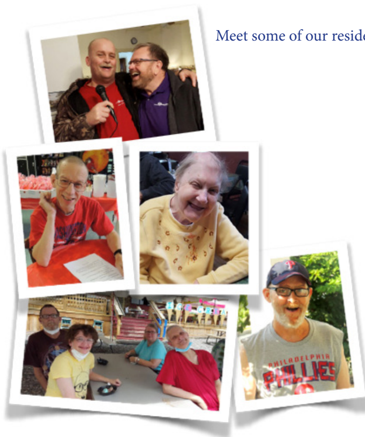
Meet some of our residents.

a result, 4021 individuals no longer have that community option for care.